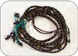
Encased in a nylon braided loom the standard electrical wiring harness used by Stellar covers all functions and features the use of weather tight connectors. Wiring is labeled every 6 inches for identification.

• Every Stellar mechanical service body features our Torq-Isolator crane support design and isolates the crane compartment from the rest of the side pack. Lifting stresses are transferred to the stabilizers and box-type subframe, not the compartment doors.