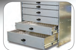
Heavy-duty aluminum drawer system. Rated to hold up to the rigors of heavy-duty use. 500 lb capacity drawer slides and hardware, carry a full lifetime warranty.