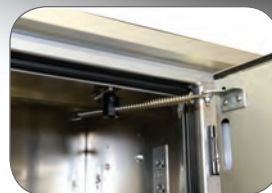
Double spring over center door closures on all vertical doors keeping door in positive open or closed position.