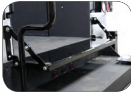
1/8 inch aluminum double panel tailgate with hinged arm brackets to provide a stout working surface.