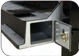
Full width longbar storage compartment integrated into the rear workbench bumper. Removable vise pedestal is standard.