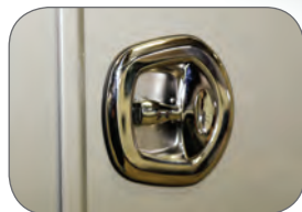
3 Point compression latches positively compress compartment weather strip for weather tightness while allowing easy access.