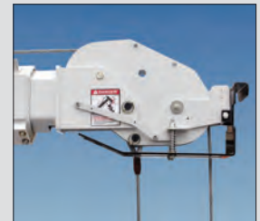
Low Profile Position