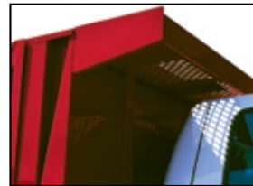
Optional 36" or 42" cab shield available with optional 12" punched hole tool tray