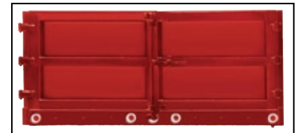
Optional 2-section swing-out cargo body rear