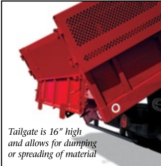
Tailgate is 16" high and allows for dumping or spreading of material