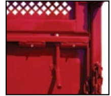
Dead-bolt style door and tailgate latches include grease zerks for lubrication