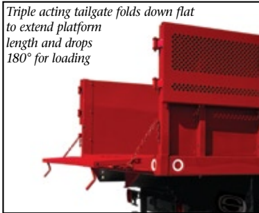
Triple acting tailgate folds down flat to extend platform length and drops 180° for loading