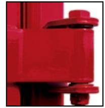
Heavy duty hinges with nylon bearings