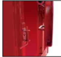
Doors open and lock to the side of the body with conveniently placed latches that can be operated from ground level.