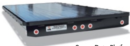
Super Duty Platform