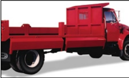
Two-piece drop sides with removable center post are standard on 14' and 16' models. 12' model has one-piece sides.

Your Omaha Standard distributor will help you put the right body and hoist package together for optimal performance and safety.