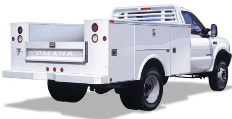
108" Service Body shown on a dual rear wheel truck. Rear window protector is a popular option.

In the interest of continuing product improvement, Omaha Standard Inc. reserves the right to modify, change or revise design and specifications and furnish product so altered without prior notice.