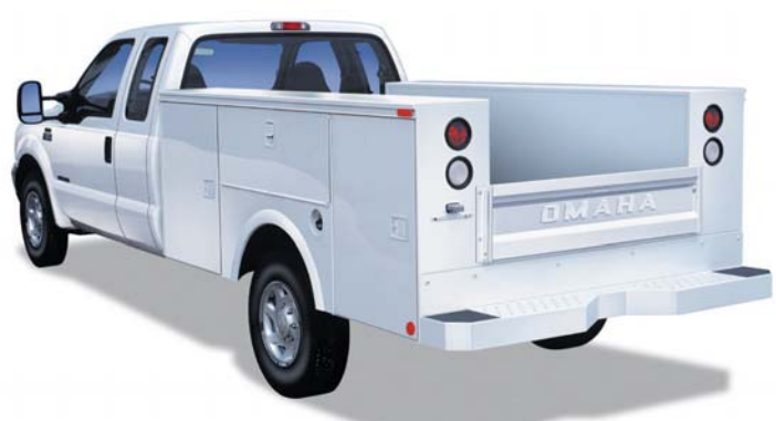
108" Service Body shown on a single rear wheel truck.